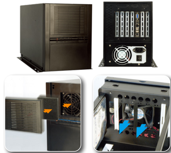
Replaceable fan filter

CD-ROM and HDD are not included in package.