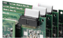
SSI bus cable for multiple cards synchronization

Termination Board with one 68-pin SCSI-II Connector and DIN-Rail Mounting (Cables are not included. For information on mating cables, refer to Section 12.)