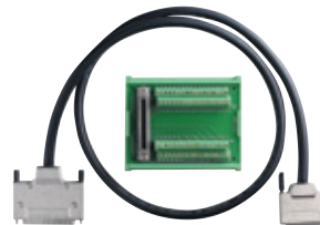
Termination board DIN-68S-01 & 68-Pin SCSI-VHDCI cable ACL-10568-1