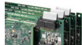
SSI bus cable for multiple cards synchronization

* Note: Analog output related pins on the DAQ/DAQe-2214