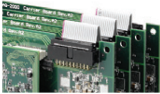
SSi bus cable for multiple cards synchronization