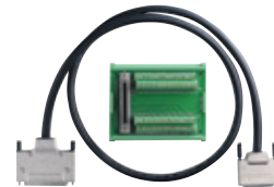
Termination board DIN-68S-01 & 68-Pin SCSI-VHDCI cable ACL-10568-1